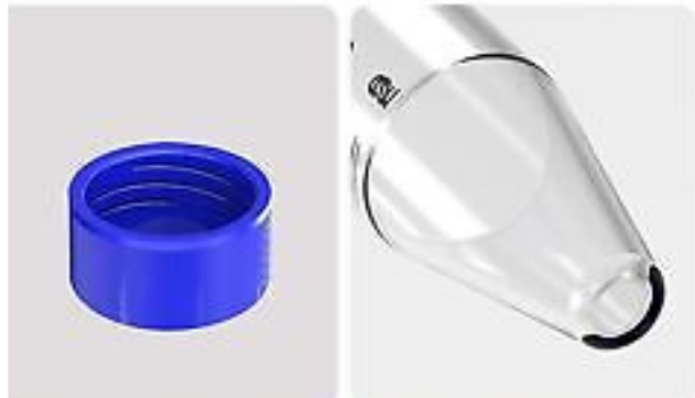
Leak-proof Screw Cap