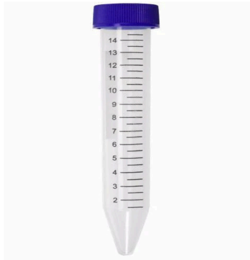
15 ml Centrifuge Tubes